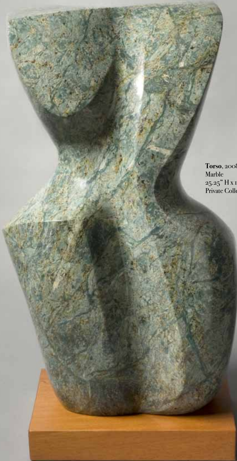
Torso , 2008 Marble 25.25" H x 12.5" W x 8.5" D Private Collection