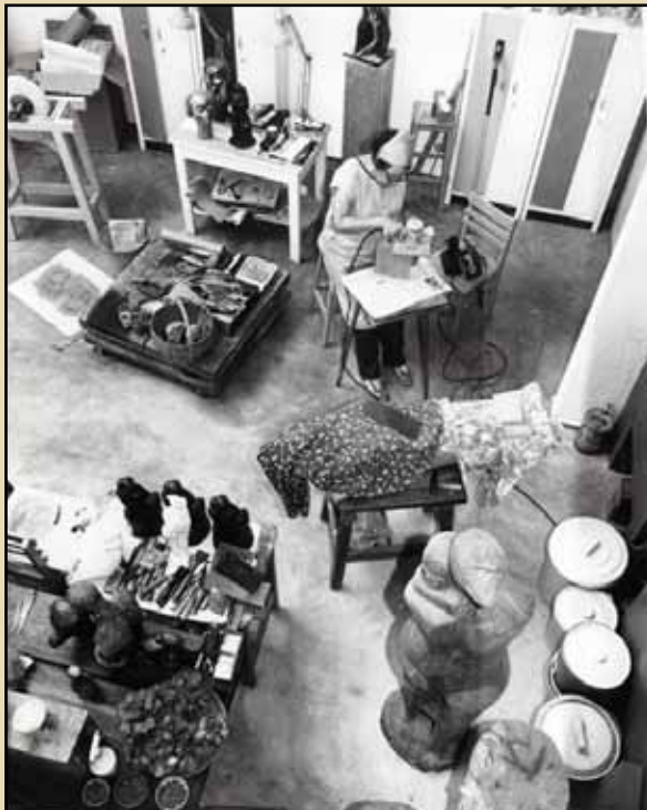
Elizabeth Catlett at work in her studio, circa 1983