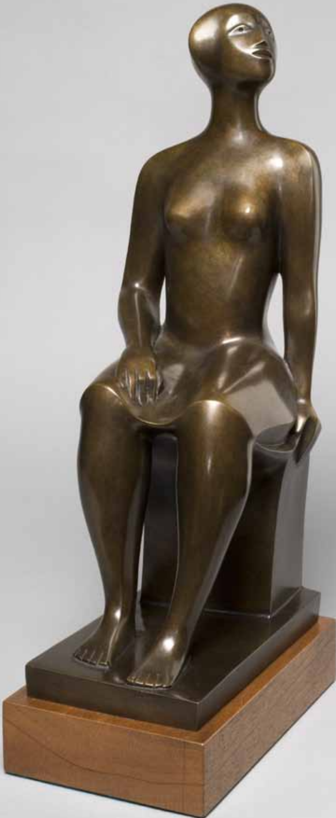
Seated Figure, 2003 Bronze 17.75" H x 8.5" W x 5" D Private Collection