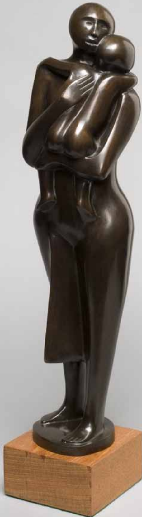
Mother and Child, 1978 Bronze 16.25" H x 5" W x 4" D Private Collection