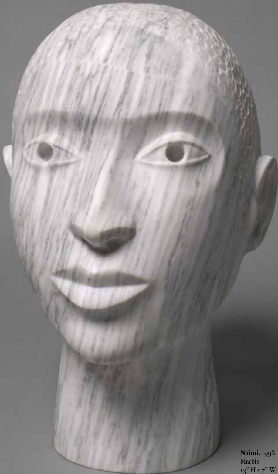
Naimi, 1998 Marble 13" H x 7" W x 12" D Private Collection